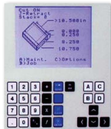
CMT 330 CONTROL PANEL

The CMT 330 can store up to 99 jobs for even faster set-up. Complete job set-up is achieved on a single screen. Simply enter the five required dimensions of the job at the respective graphical prompts on the display. Push the "send" key and in less than 20 seconds, your book block is ready to be cut.